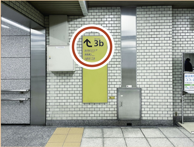
01/ Use the Exit 3b of the station