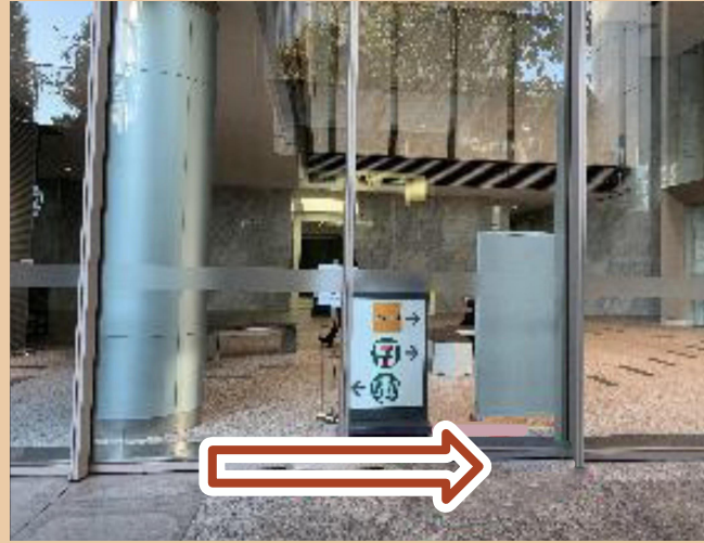
02/ Go to the right direction after reaching the ground