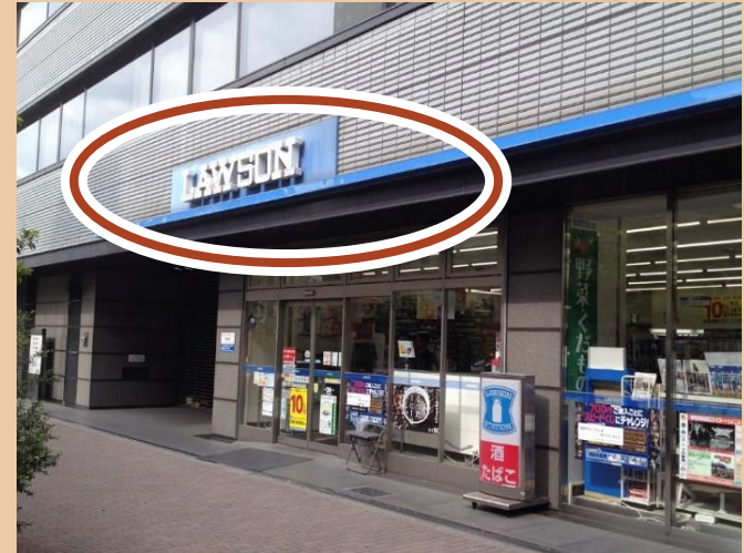
06/ You will see LAWSON , and our staff will be waiting there.