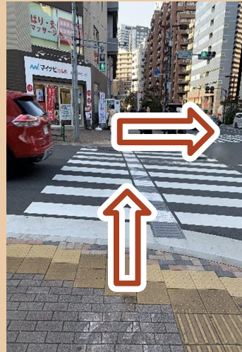
05/ Go straight, and turn right. Across the road, and turn left.