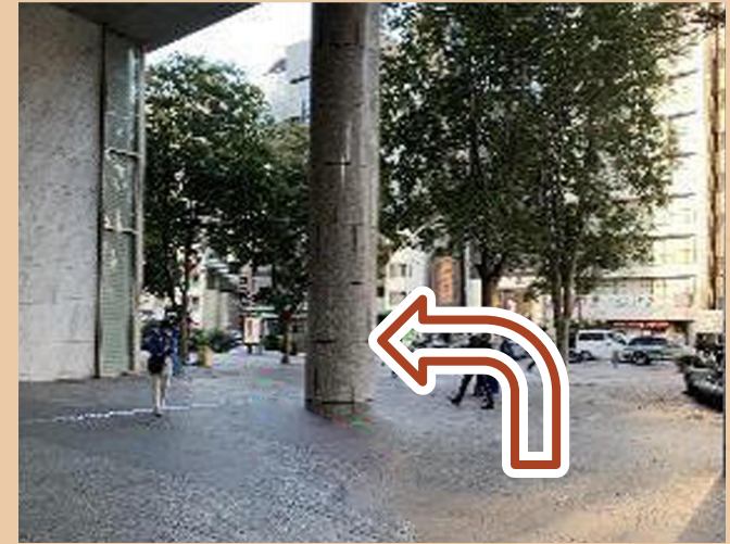
03/ Turn left.